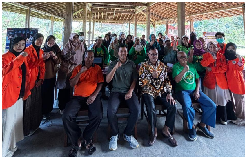
Figure 1. Socialization of the program to KWT Rejoarum and the Pandowharjo village government

This study uses a participatory action method that emphasizes active collaboration between the empowerment team and the community in all stages of the activity, from planning and implementation to evaluation. This approach was chosen to ensure that the solutions offered are truly in line with the needs, conditions, and resources of KWT Rejoarum, while empowering group members to become the main actors of change. The initial approach was to hold a socialization event